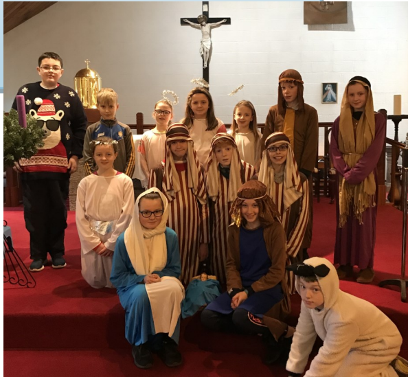
The Nativity Play is taking place on Christmas Eve at 7pm in Clooney Church. Children from 3rd to 6th class are partaking in it. We hope you all enjoy it.