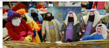
THE TRAVELLING CRIB CAME TO VISIT THE SCHOOL